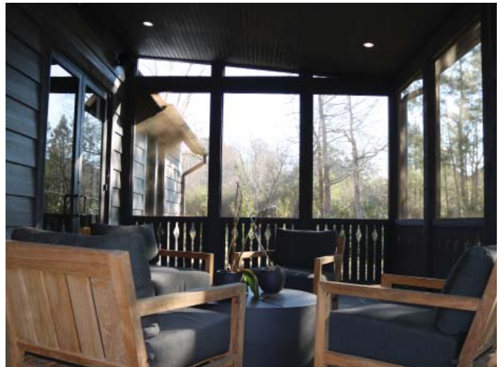
Covered, screened-in outdoor terrace