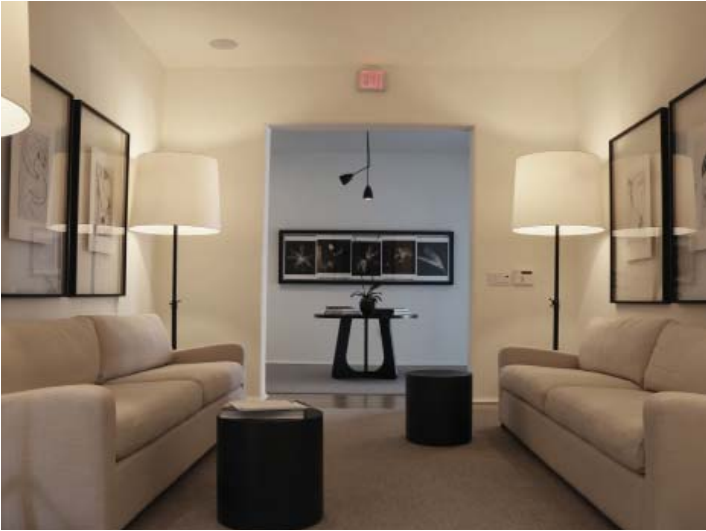
Entry seating area or waiting area